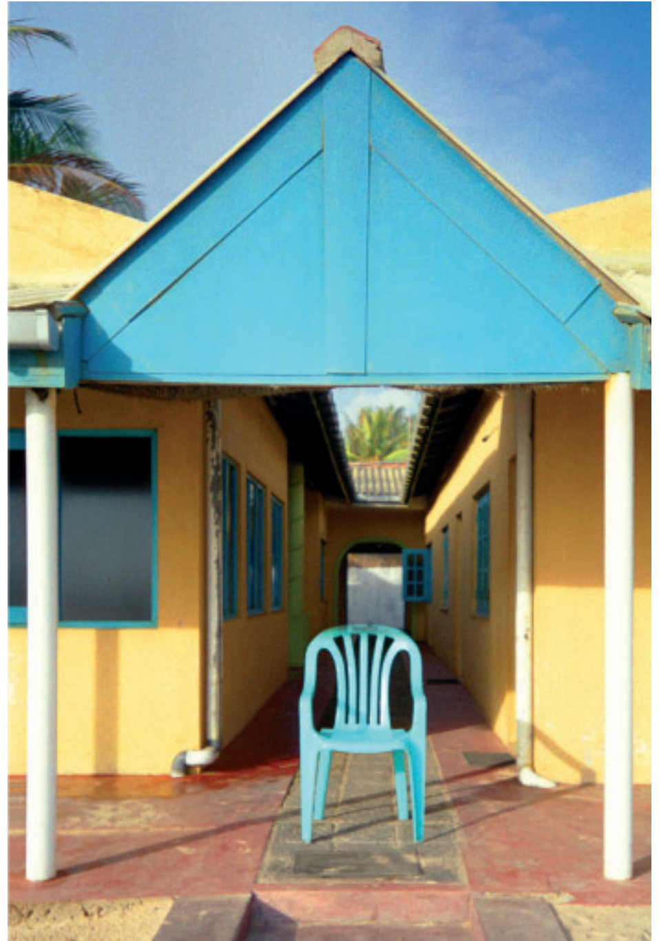
Photoshop CMYK / Directly placed in PM CMS on CMYK source Euroscale Coated