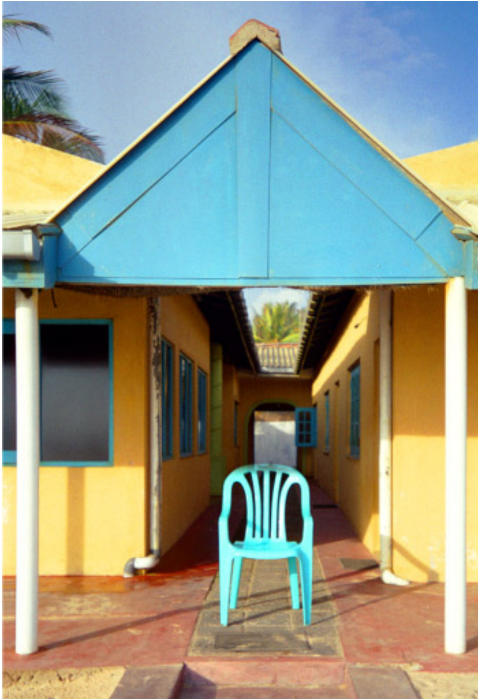
Photoshop sRGB / Directly placed in PM CMS on RGB source sRGB

This example shows an sRGB image (left) and a CMYK image by Euroscale Coated v2 (right). The color of the chair and some other blues and cyans cannot be reproduced accurately by CMYK.