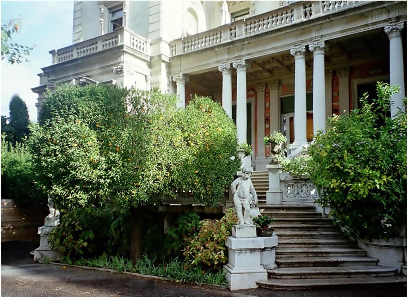
Istituto Svizzero di Roma