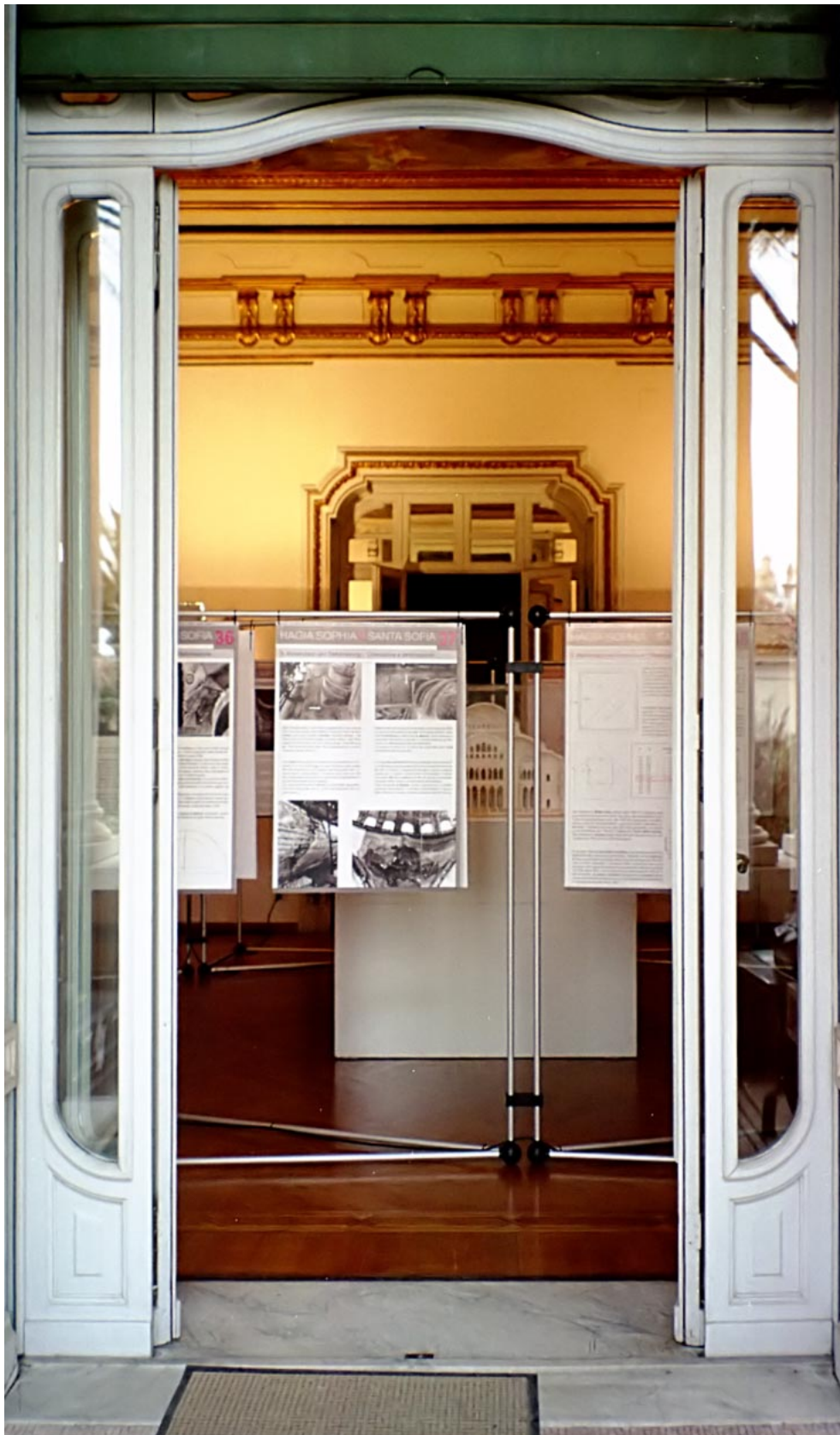
Exhibition room in the Istituto Svizzero di Roma