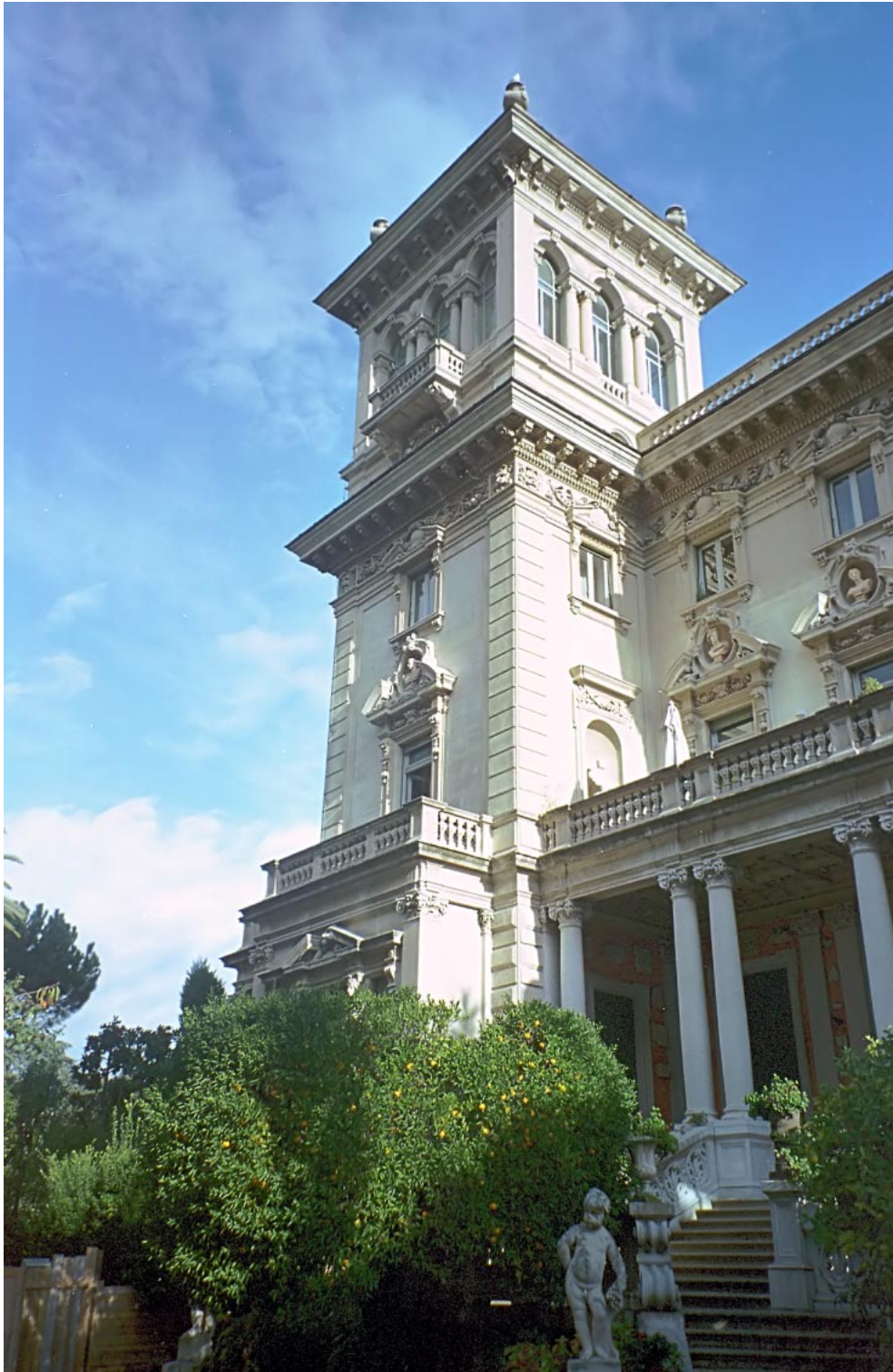
Istituto Svizzero di Roma