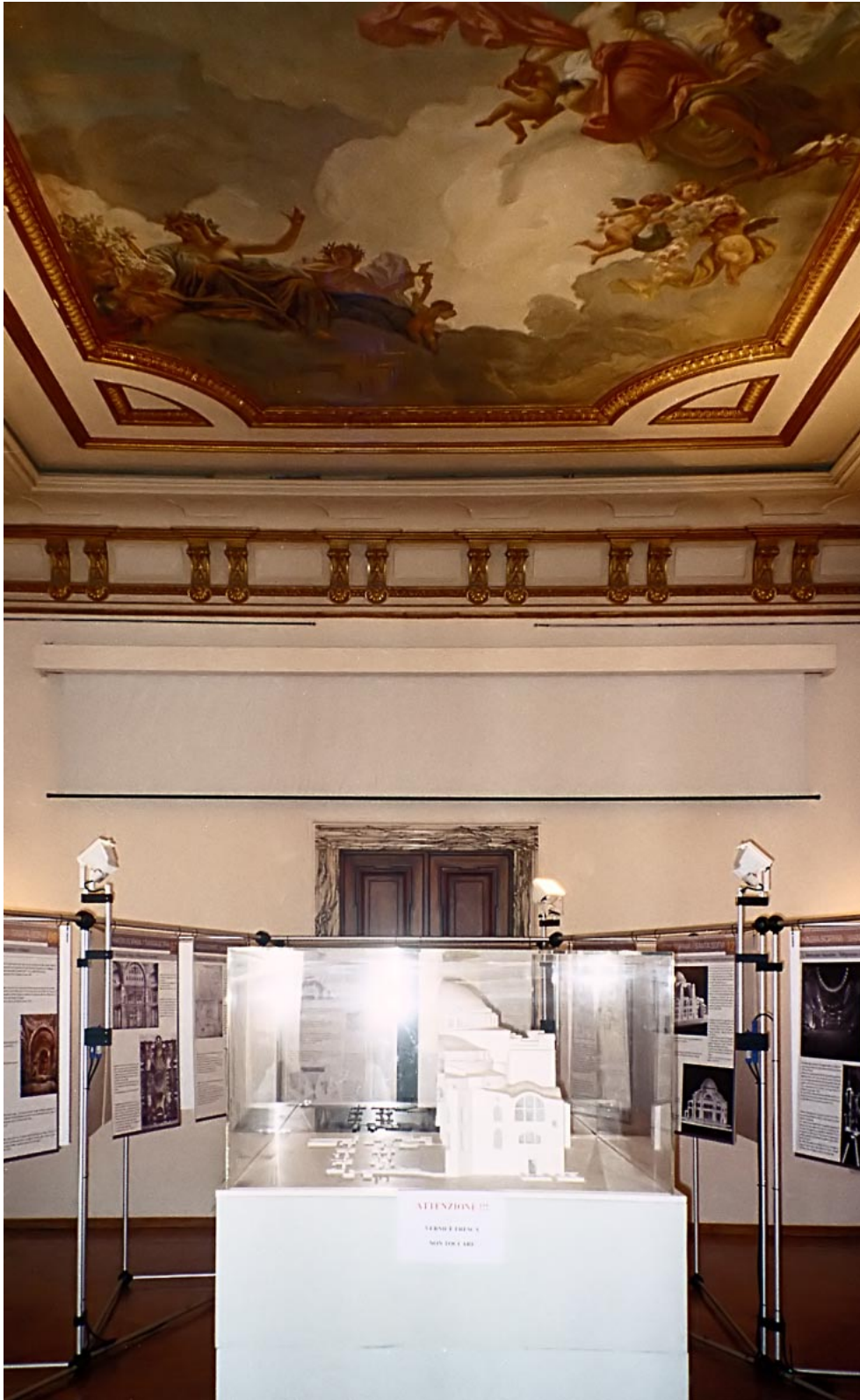
Exhibition room in the Istituto Svizzero di Roma