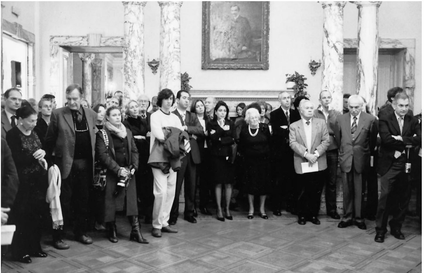
Visitors during the speech of somebody else