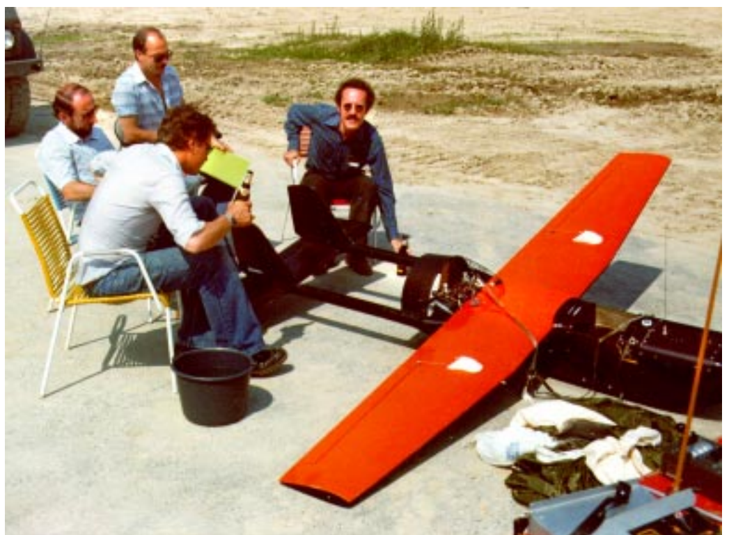
outpost for field trials in Lichtenau.

The plane is launched by a catapult and lands by parachute. The first flight was successful.